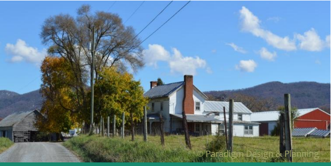
The History of Port Republic

Participants at the final workshop wanted to maintain the momentum established during the community engagement process and wish to remain involved as the County moves forward to update its Comprehensive Plan, and if any related zoning updates are considered. County staff and partner community groups expressed a willingness and desire to continue to work with stakeholders in the area on implementing the next steps in the coming months.